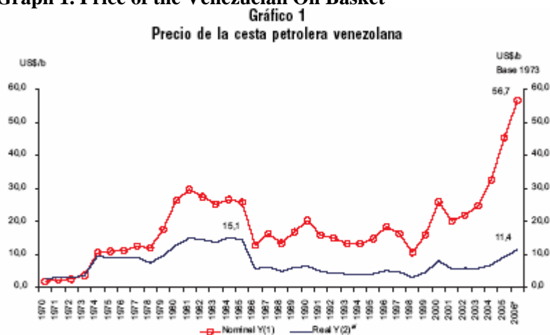
Graph 1. Price of the Venezuelan Oil Basket

*Obtenido a partir del implícito combinado (inflación y tipo de cambio) de los precios de la cesta OPEC.